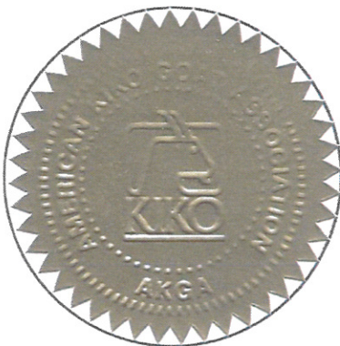
Registered Seal American Kiko Goat Association